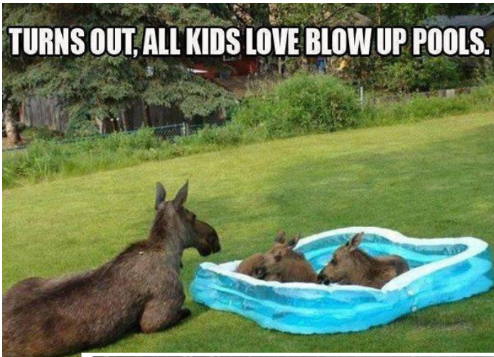
URNS OUT, ALL KIDS LOVE BLOW UP POOLS.