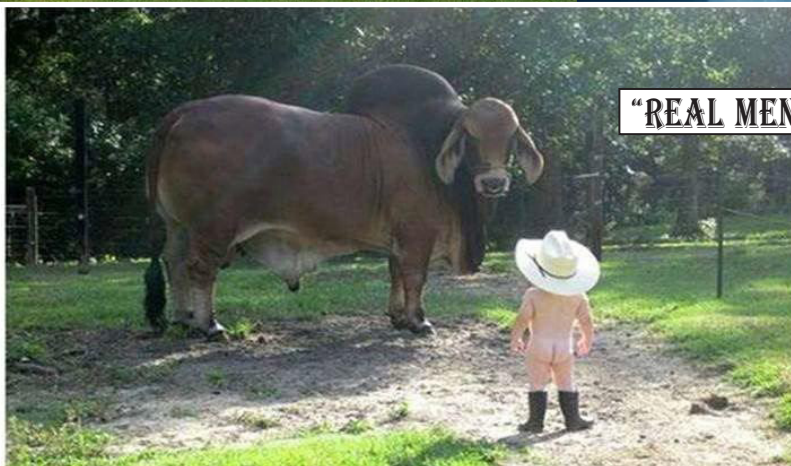
“REAL MEN HAVE NO FEAR”