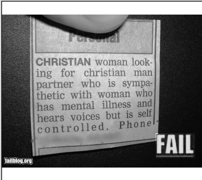
Personal CHRISTIAN woman looking for christian man partner who is sympathetic with woman who has mental illness and hears voices but is self controlled. Phone