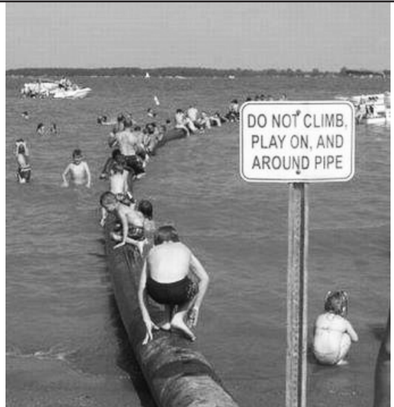
DO NOT CLIMB, PLAY ON, AND AROUND PIPE