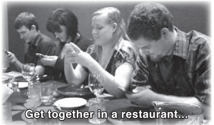
Get together in a restaurant...