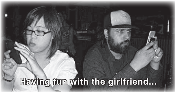
Having fun with the girlfriend...