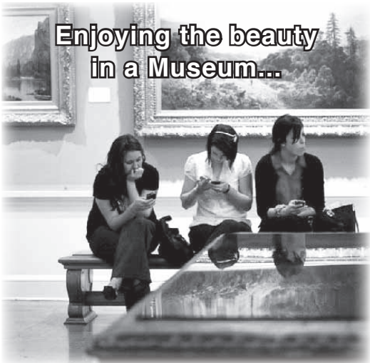
Enjoying the beauty in a Museum...