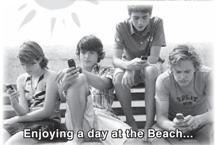
Enjoying a day at the Beach...