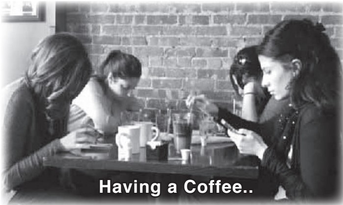
Having a Coffee..

“I fear for the day when technology overlaps with our humanity. The world will only have a generation of idiots.”