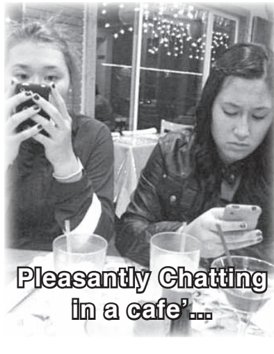
Pleasantly Chatting in a cafe'...