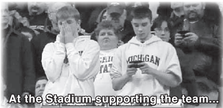
At the Stadium supporting the team...