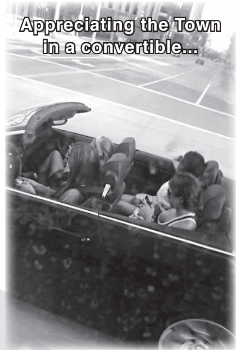
Appreciating the Town in a convertible...