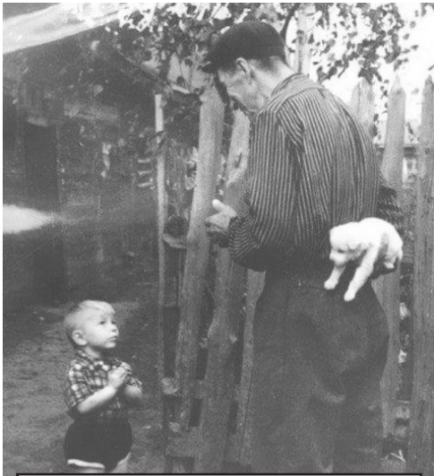
“A Few Moments Before Happiness”

As a kid, did you ever knock on people's doors and run away before they could answer? Well, guess what...we are hiring