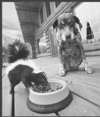
PATIENCE and WISDOM

Two of the greatest qualities to have in life are: