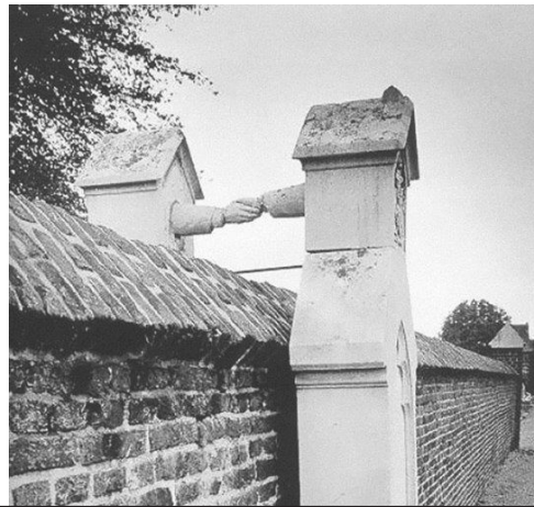
“Graves of a Catholic Woman and Her Protestant Husband in 1888.”

You know, there are some things that you just never think of ..... like Mt. Rushmore from the Canadian side.